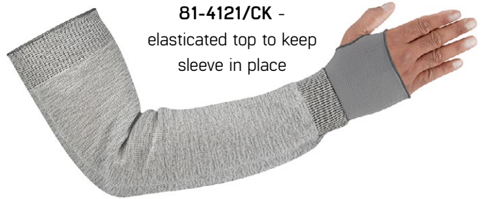
81-4121/CK - elasticated top to keep sleeve in place