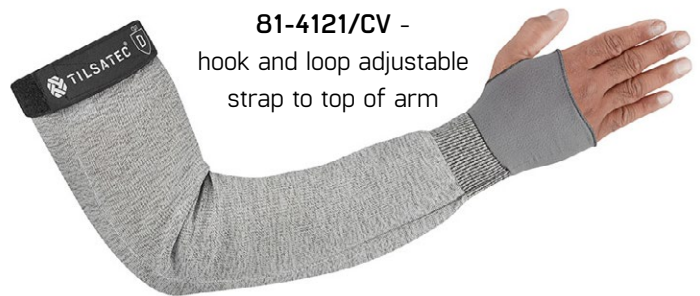
81-4121/CV - hook and loop adjustable strap to top of arm